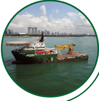
Diving Support Vessel 12 Man Saturation System