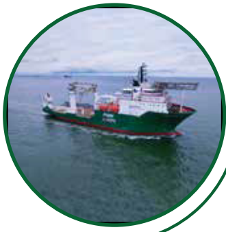
Offshore Construction Vessel DP3/250T AHC Crane