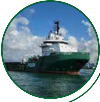
AHT / AHTS Up to 150T Bollard Pull