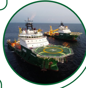
MPSV / UMV 120T Subsea Crane