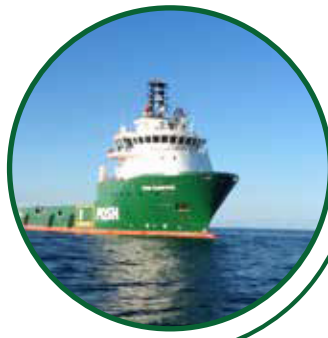
Platform Supply Vessel Up to 820m 2 Deck Space