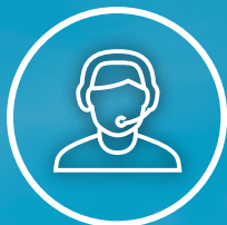
MOB BASE MANAGEMENT