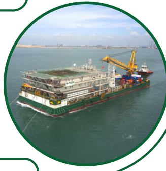
Accommodation Vessels and Work Barges Up to 238 POB