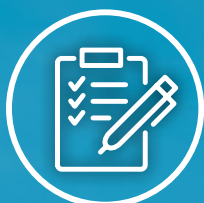
PLANNING & ENGINEERING

Our end-to-end capabilities includes: planning & engineering, project logistics, mooring pre-lay and base management, to tow out & hook up, cable installation, operations & maintenance, and decommissioning.