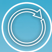
OPERATIONS & MAINTENANCE