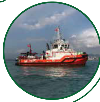
Harbour Tugs Up to 73T Bollard Pull