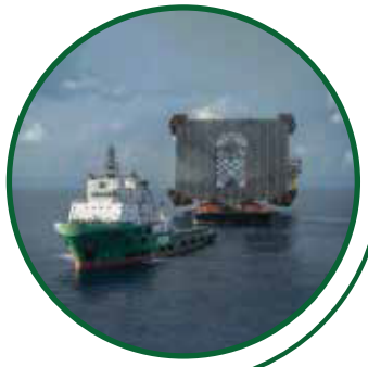
Ocean Going Tugs Up to 255T of Bollard Pull