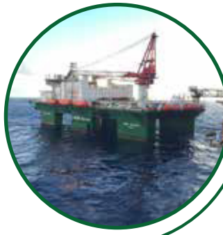
Semi - Submersible Vessels 750 POB