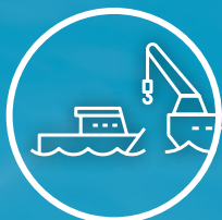
TOW OUT & HOOK-UP